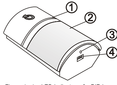
Figure 1.: 1 – LED indicators; 2 –PIR lens; 3 – hole for locking screw; 4 – cover tab

It is necessary to take into consideration that there should be no obstacles in the detector's field of view which quickly change temperature (electrical heaters, gas appliances, etc.), which move (curtains hanging above a radiator, robotic vacuum cleaners, etc.) or the movement of pets. Despite the detector being very immune to false alarms, it is not recommended to install the detector in places with intense air circulation (close to ventilators, air conditioning, vents, unsealed doors, etc.). There should be no obstacles in the detector's field of view that would also obstruct its view into the guarded space.