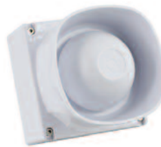
WP version white